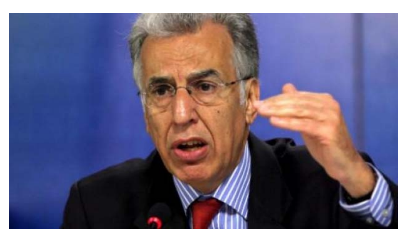
Diamandouros believes that transparency is now much higher on the agenda of the EU administration.