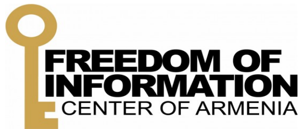
Freedom of Information Center of Armenia