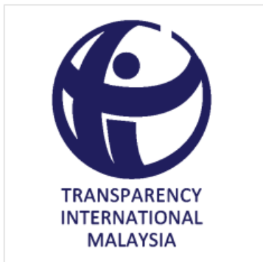
Transparency International, Malaysia