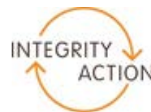
Integrity Action, UK