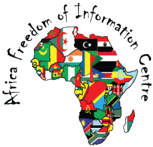
Africa Freedom of Information Centre, Uganda