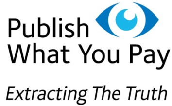
Publish What You Pay