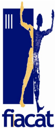
International Federation of Action by Christians for the Abolition of Torture, France