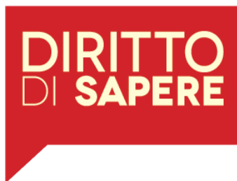
Diritto di Sapere, Italy