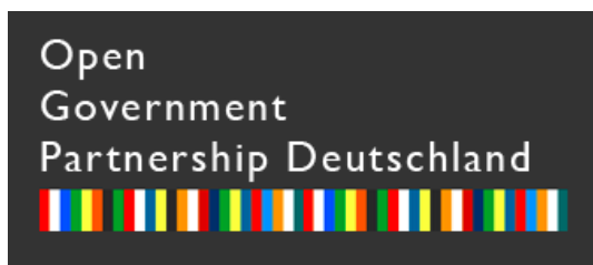
German Working Group Open Government Partnership