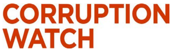
Corruption Watch, UK