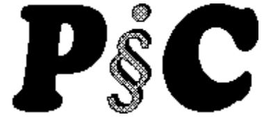
Legal-Informational Centre for NGOs, Slovenia