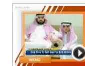
Dad Tries To Sell Son On Facebook For $20 Million