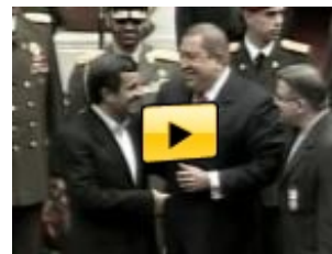
Chavez Welcomes Ahmadinejad in Caracas