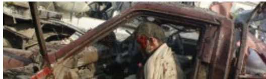
Bomb Explodes In Northwest Pakistan, Killing At Least 25