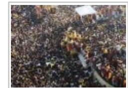
Millions Of Roman Catholics Defy Warning...