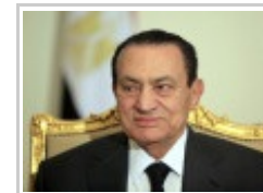
Egypt Official: Mubarak Leaves Hospital For Trial