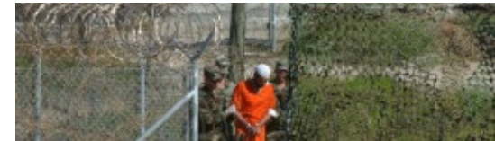
10 Years Later, Guantanamo Is STILL Open