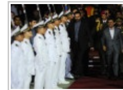
PHOTOS: Ahmadinejad Tours Latin