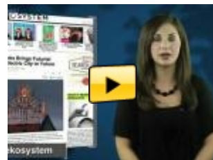
Yahoo! Debuting Original Series from Tom Hanks