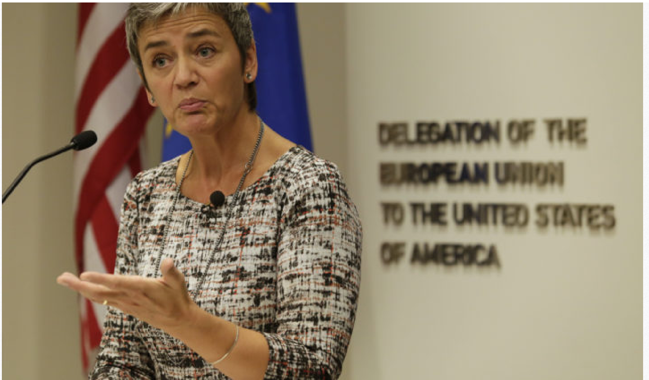
European Commissioner for Competition Margrethe Vestager speaks during a news conference at the EU Delegation in Washington